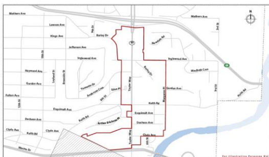
Map 7: Taylor Way-Park Royal Local Area Planning Boundary

For the Taylor Way Local Area Plan (retitled Taylor Way-Park Royal Local Area Plan), the planning boundaries would be expanded to incorporate Park Royal North. The inclusion of the existing Park Royal North mall and parkade sites would expand the planning boundary from 68 acres to 82 acres of developable lots to enable more housing supply.