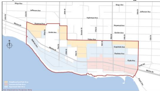
Map 5: Ambleside Local Area Planning Boundary

For the Taylor Way Local Area Plan (retitled Taylor Way-Park Royal Local Area Plan), the planning boundaries would be expanded to incorporate Park Royal North. The inclusion of the existing Park Royal North mall and parkade sites would expand the planning boundary from 68 acres to 82 acres of developable lots to enable more housing supply.