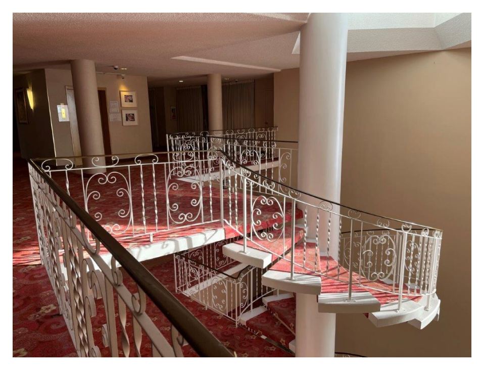
Figure 7 Interior floating stair with decorative railing, 2024.