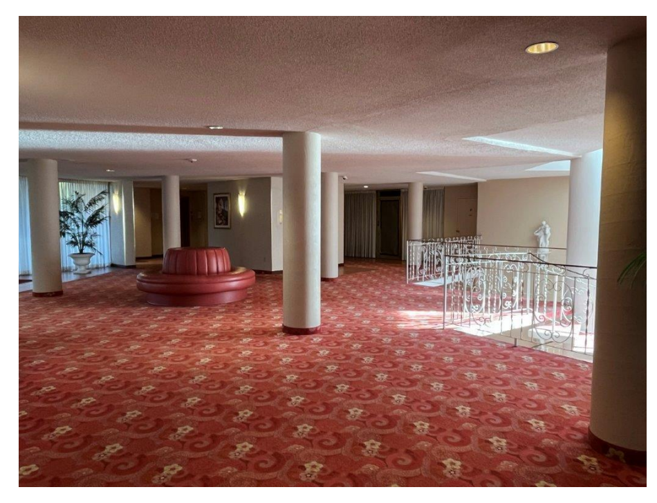
Figure 6 Lobby with poof, carpeting, decorative railings, and wall sculpture 2024.