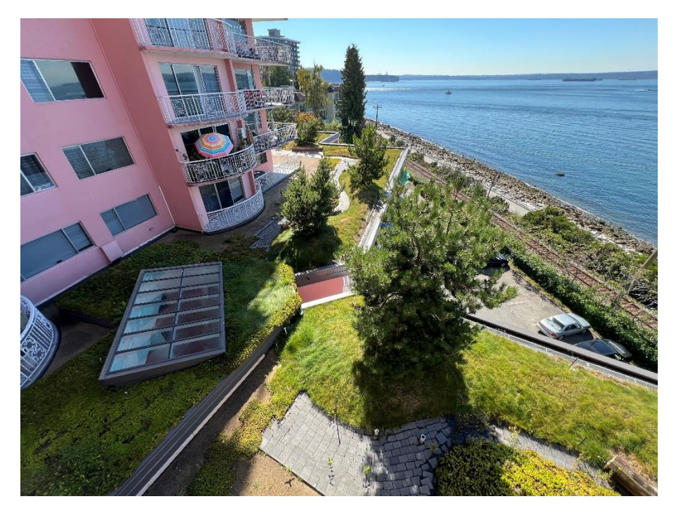
Figure 11 Rooftop garden designed by Cornelia Oberlander, 2024.