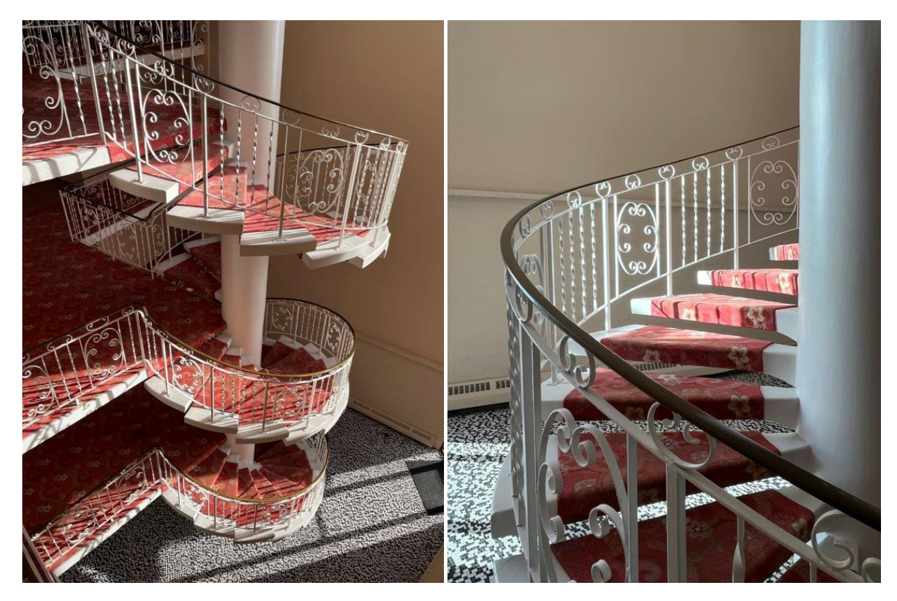
Figure 8 Floating stair, 2024.