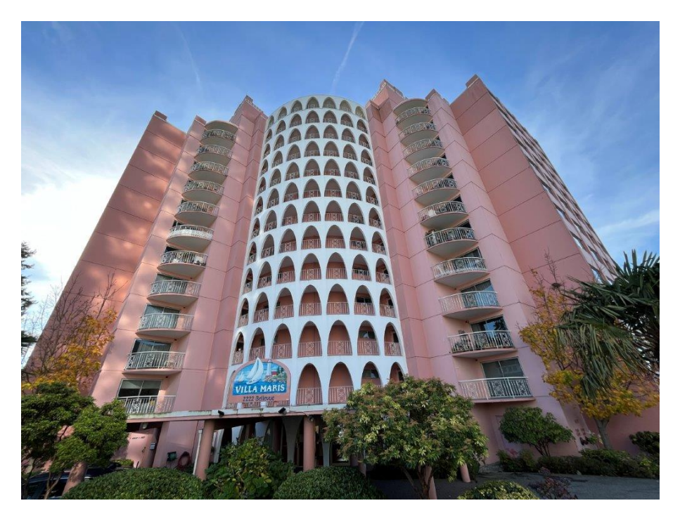
Figure 2 Exterior of the Pink Palace, 2024.