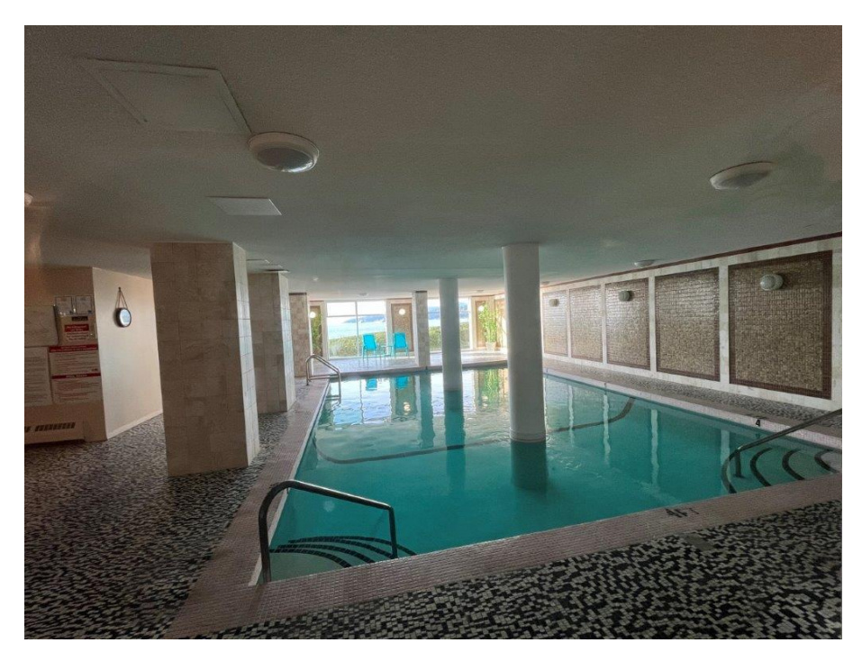
Figure 10 Interior pool, 2024.