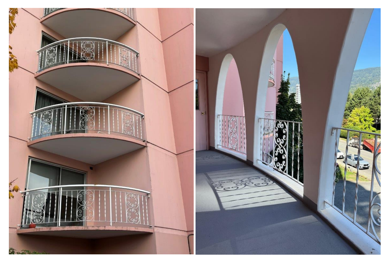
Figure 4 Balconies, 2024.