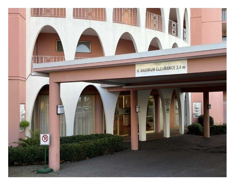
Figure 3 Porte cochere and entry, 2024.