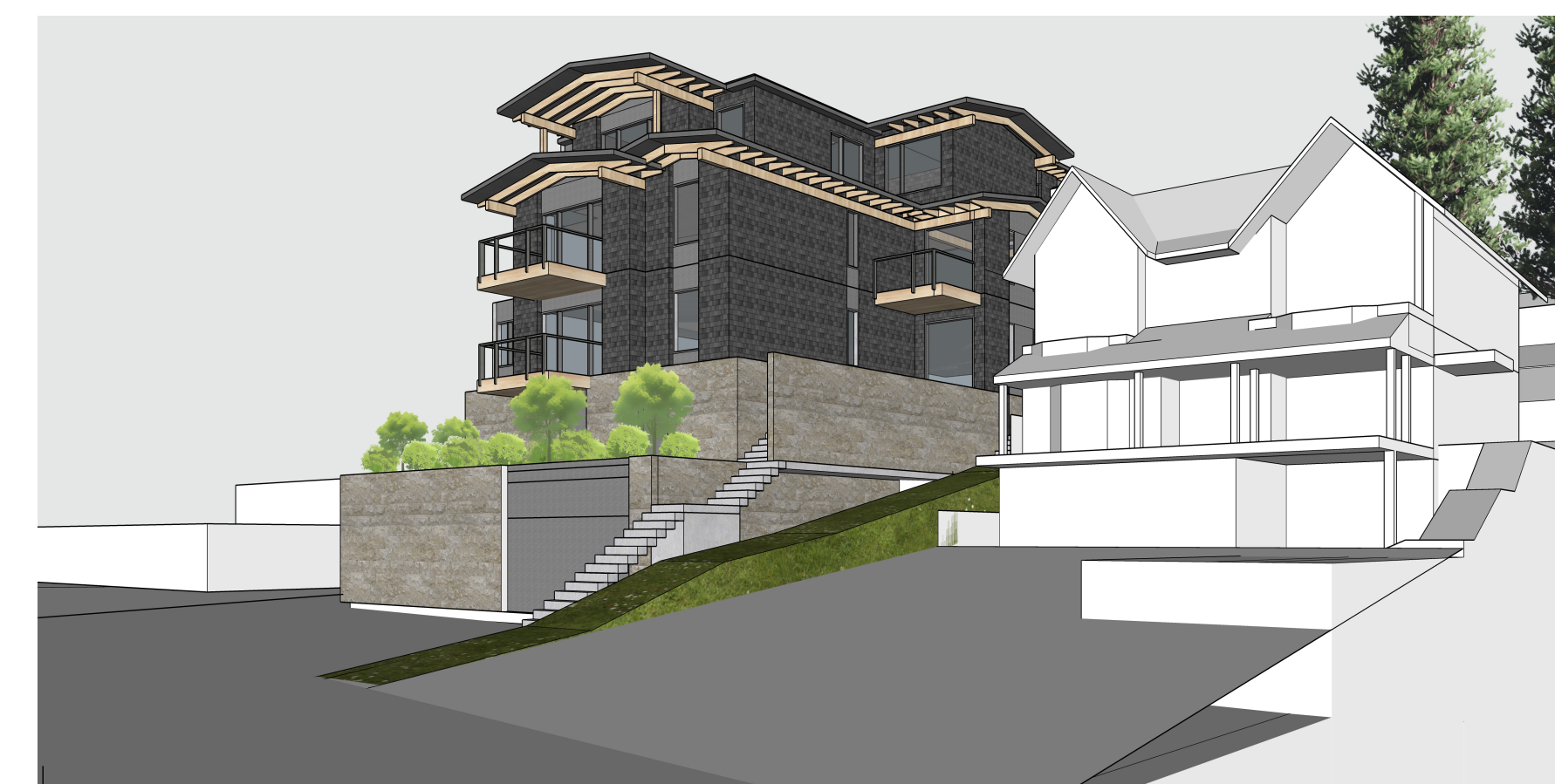
4 STREET VIEW: OLD PROPOSAL NTS