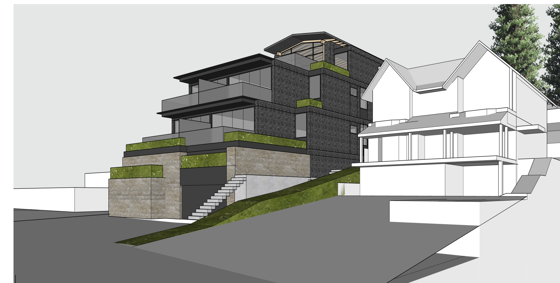
3 STREET VIEW: REVISED PROPOSAL NTS