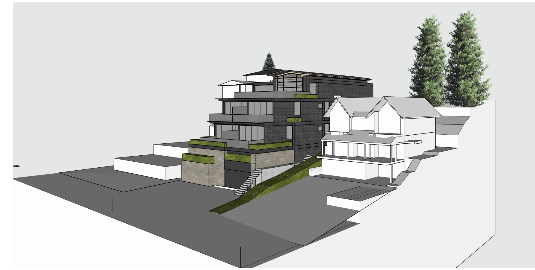
1 AERIAL VIEW: REVISED PROPOSAL NTS