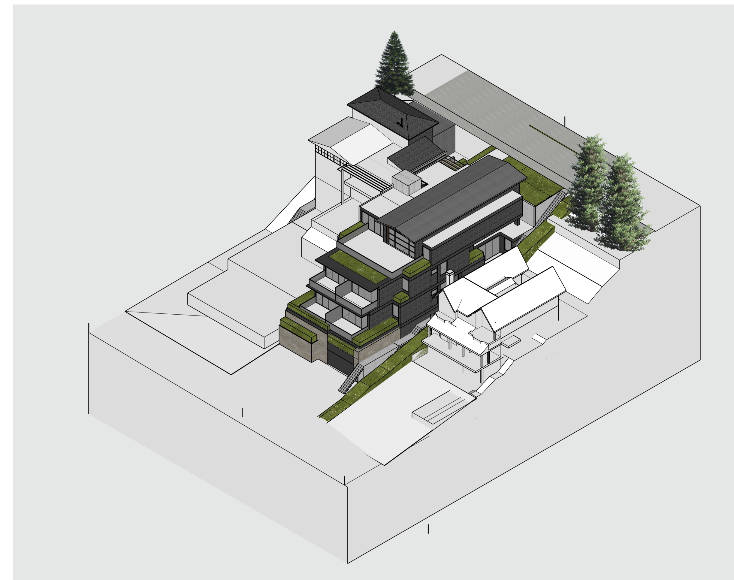
4 SOUTH EAST NTS