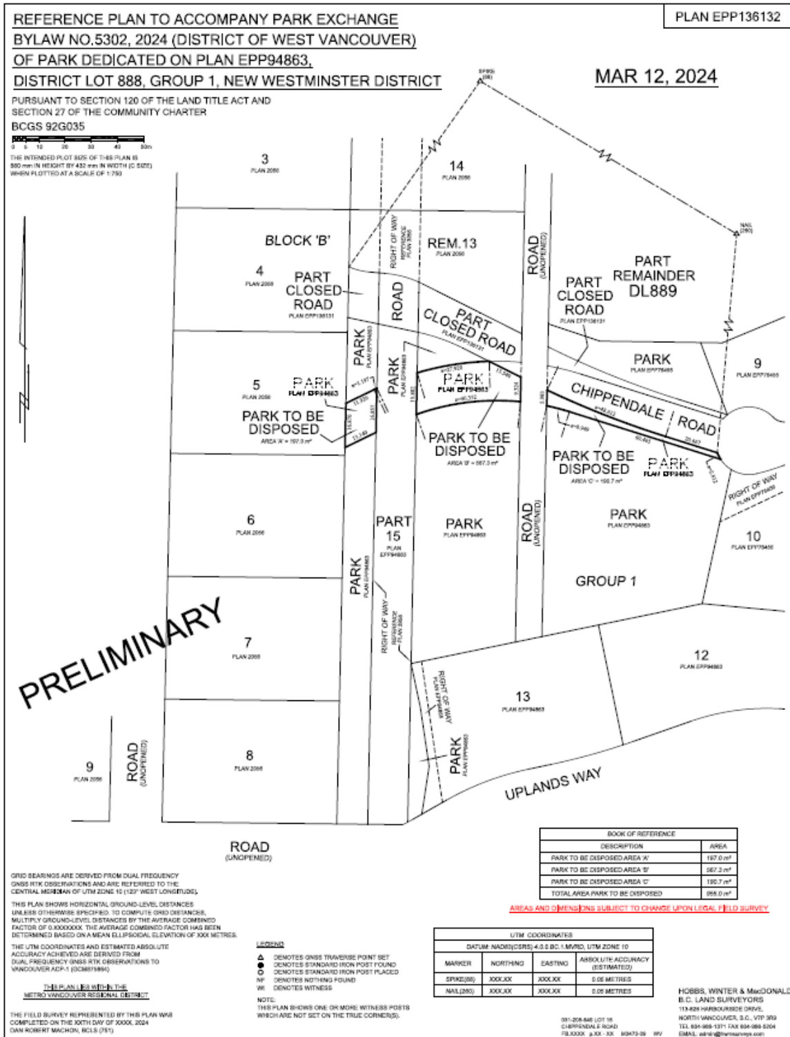
Figure 1 – Park Lands to be Disposed Of