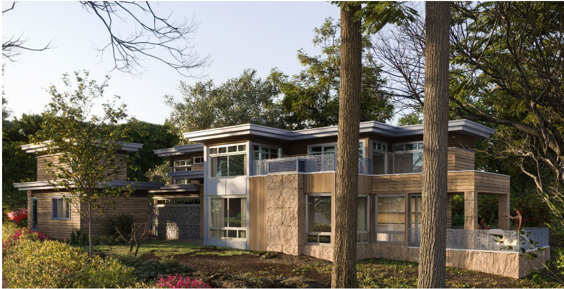
Rendering of proposed dwelling with coach house

New Two-Storey Single Family Residence with a Coach House 4798 The Highway, West Vancouver