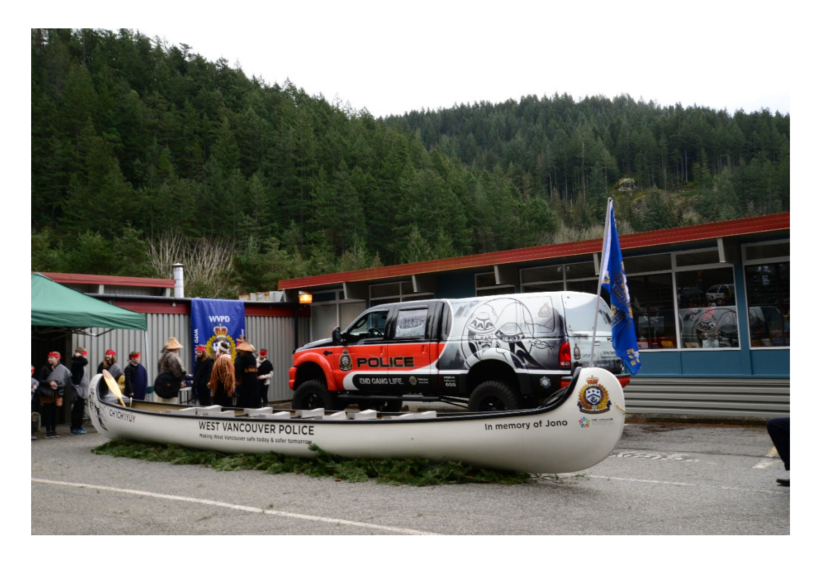
Ford F350 with Cab