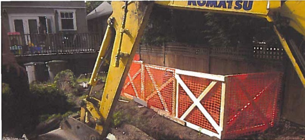
Tree fencing-wood framed snow fence