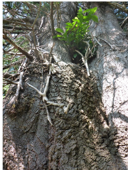
Photo 3. Over-Extended Branches