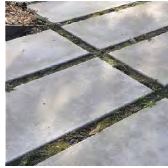
CONCRETE SLAB WALKWAY