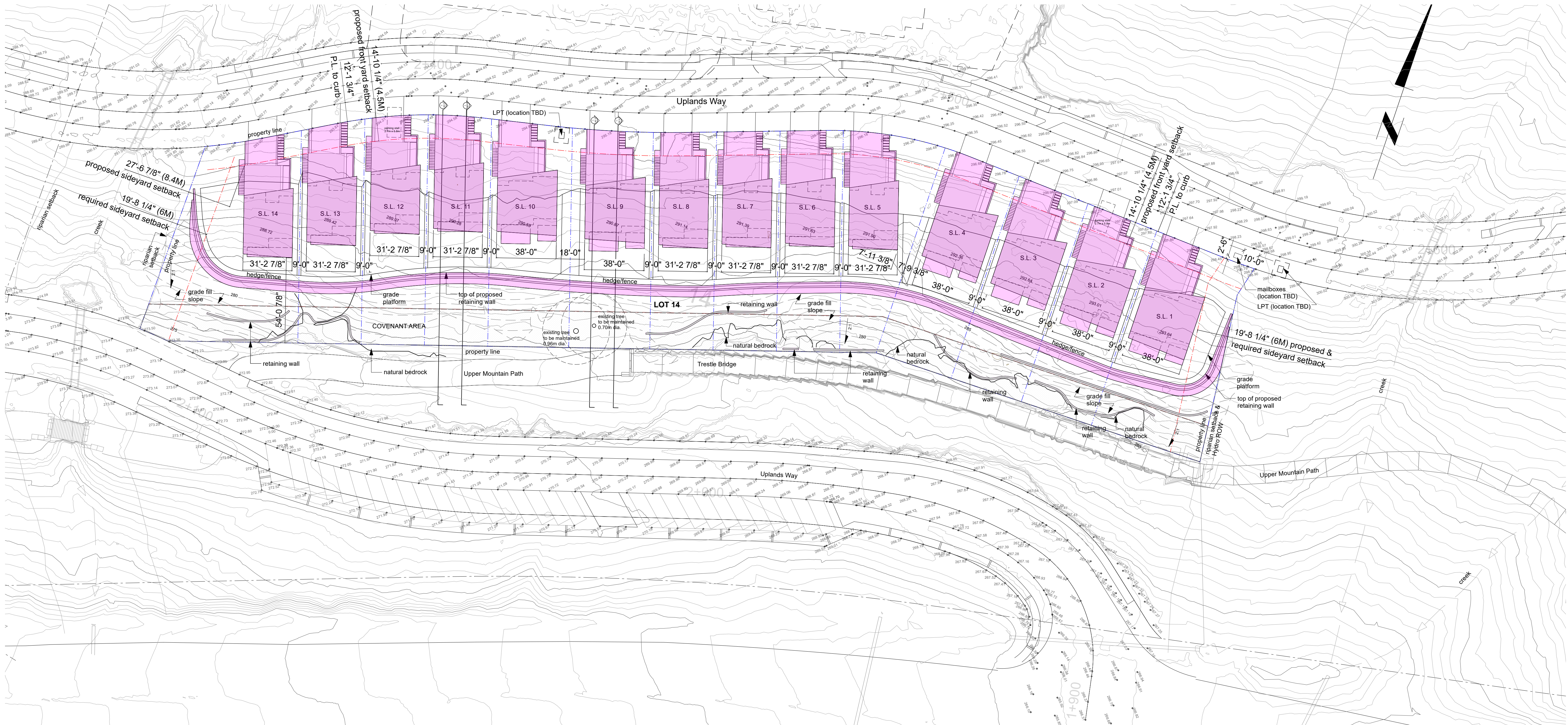
1 Site Plan Scale: 1/32" = 1'-0"

Issue C 2023-04-10 re-issued for West Van DRC D 2023-06-20 Issued for DP E 2023-09-18 re-issued for DP