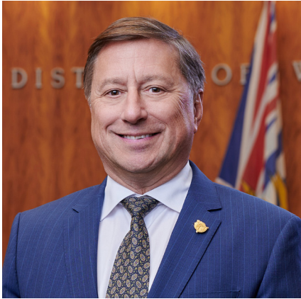
MARK SAGER | MAYOR

West Vancouver is uniquely situated with few global comparisons. We are blessed with spectacular topography and are beautifully nestled between an expansive ocean and majestic mountains, with a world-class metropolitan city only minutes away. We are a community woven of diverse cultural backgrounds and demographics, with long-standing residents who have proudly lived here for decades, and with outstanding schools and wonderful community amenities and facilities that make it an attractive place for younger families and those wishing to return to the neighbourhoods in which they grew up. It is a very special place, and thanks to the dedicated workforce, our community offers the finest police, fire, library, transit, recreation services, and municipal staff anywhere. We are proud of and respect the people who have chosen to work for the District of West Vancouver.