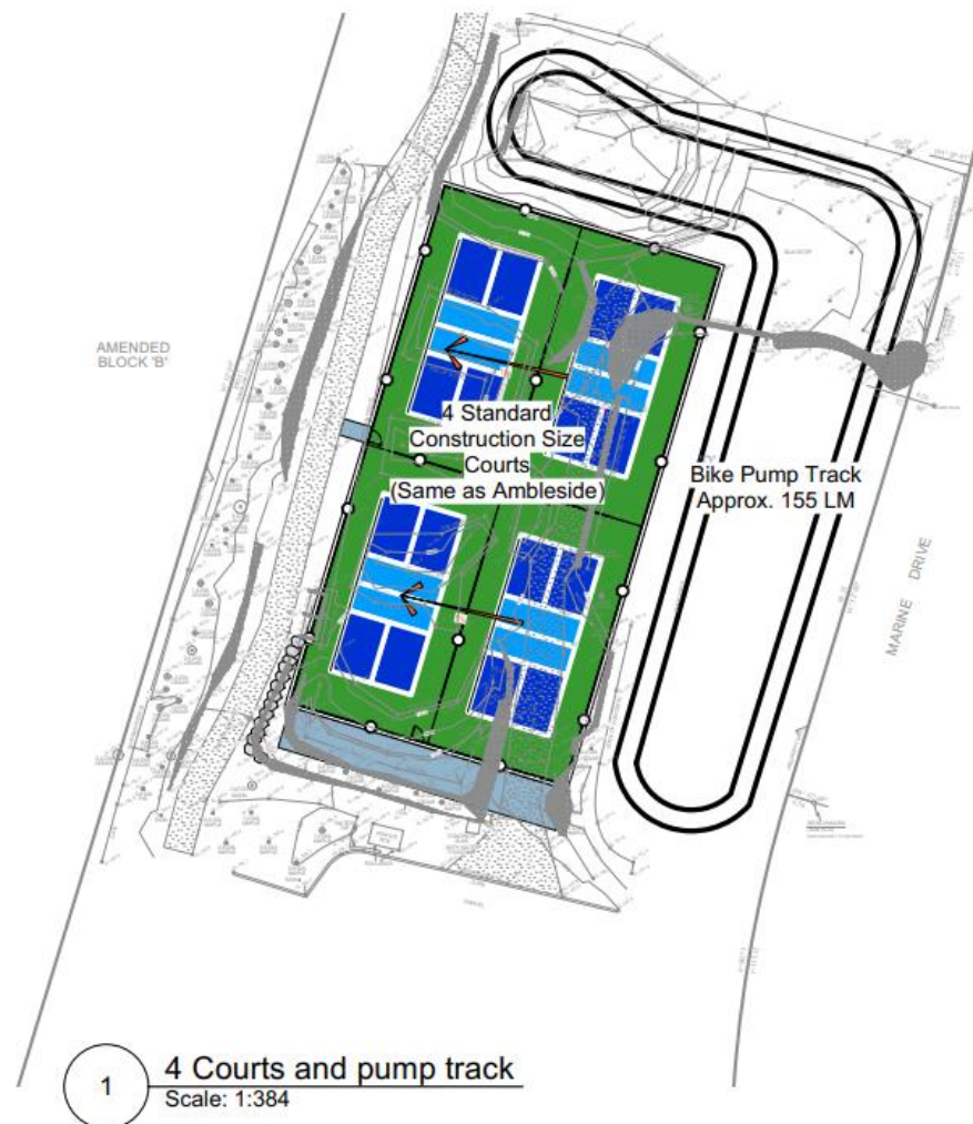
Figure 2: Proposed Pickleball Courts & Bike Pump Track

A paved pump track would provide local residents with a low-maintenance, durable, and inclusive recreation space. Unlike dirt tracks, which require frequent maintenance and repairs, a paved track supports year-round use and offers a safe, accessible environment for all skill levels. It would: