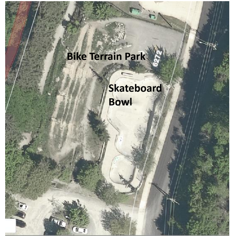
Gleneagles Adventure Park