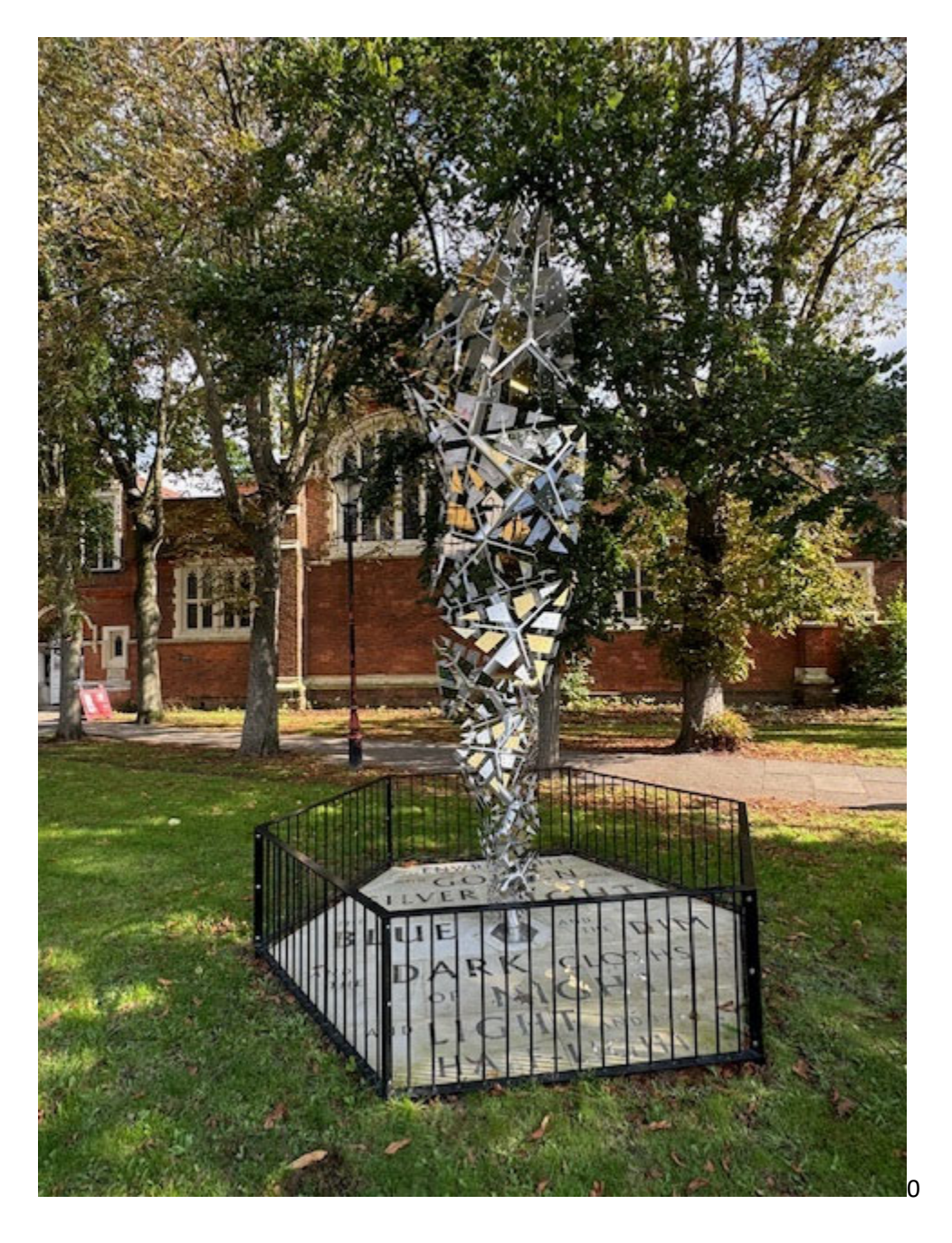
We can do better than red cubes that don't fit into and enhance our natural seaside park and environment!!!