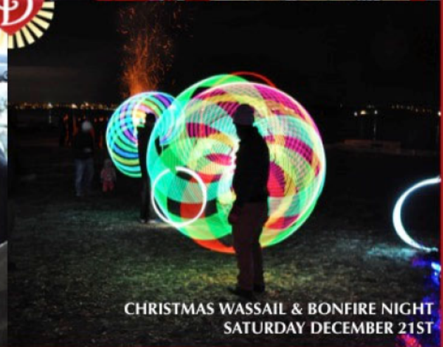
CHRISTMAS WASSAIL & BONFIRE NIGHT SATURDAY DECEMBER 21ST