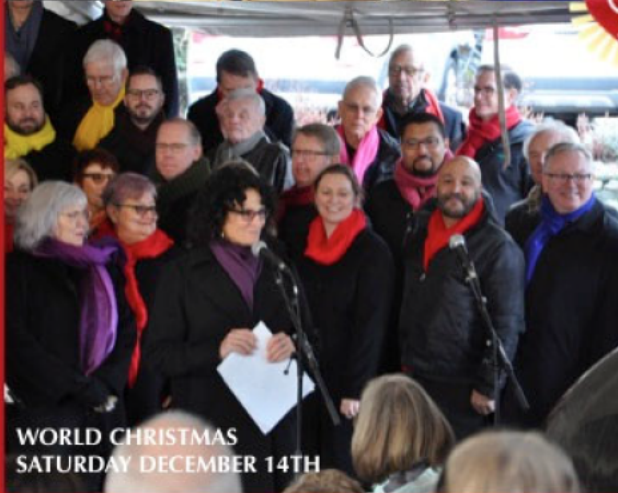
WORLD CHRISTMAS SATURDAY DECEMBER 14TH