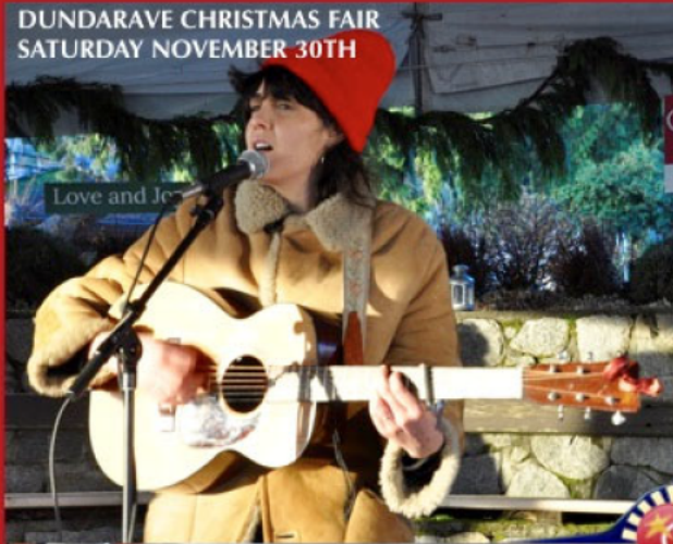
DUNDARAVE CHRISTMAS FAIR SATURDAY NOVEMBER 30TH