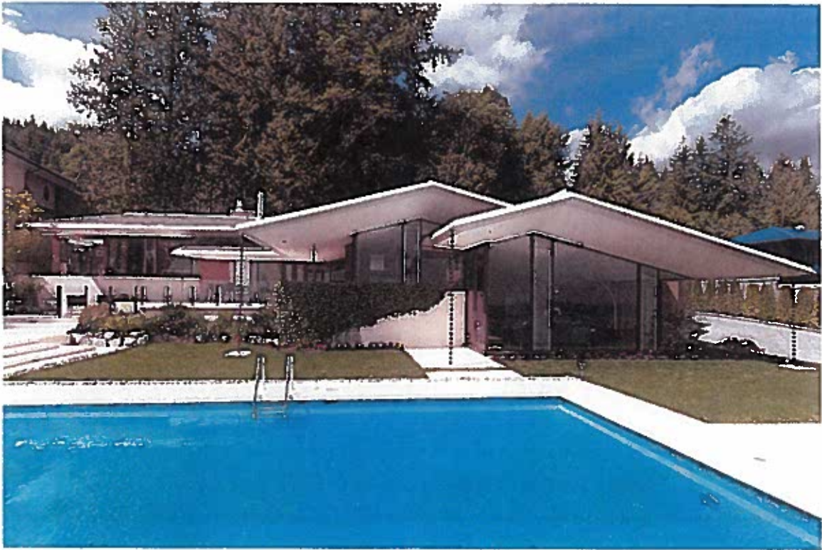
Figure 2 Recent photo