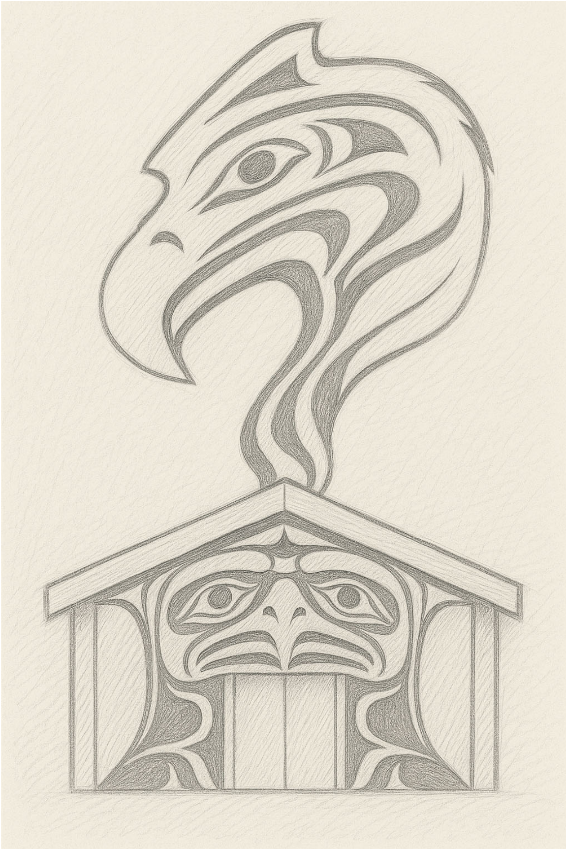
Thunderbird Carving Concept Drawing by Xwalacktun