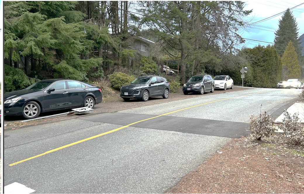
west side – parking at the south end of Glenmore Drive