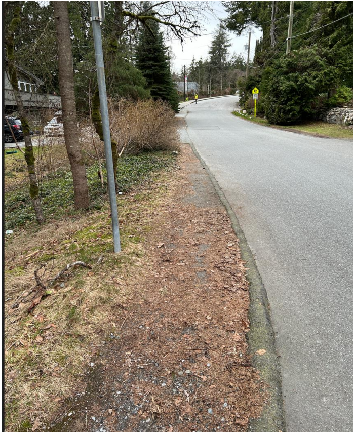
missing sidewalk on Morven Drive