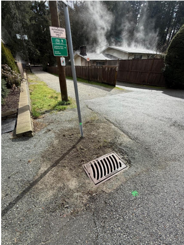
east side – 1 catch basin need to be adjusted