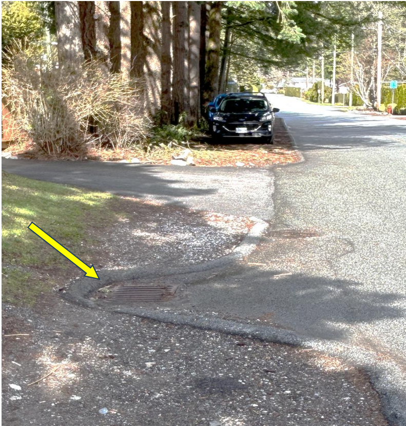
west side – 4 catch basins need to be adjusted