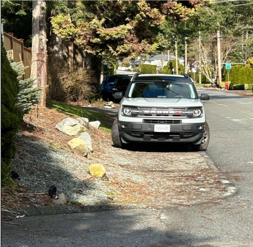
west side – low retaining walls may be required