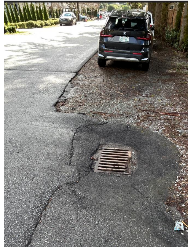
west side – 4 catch basins need to be adjusted