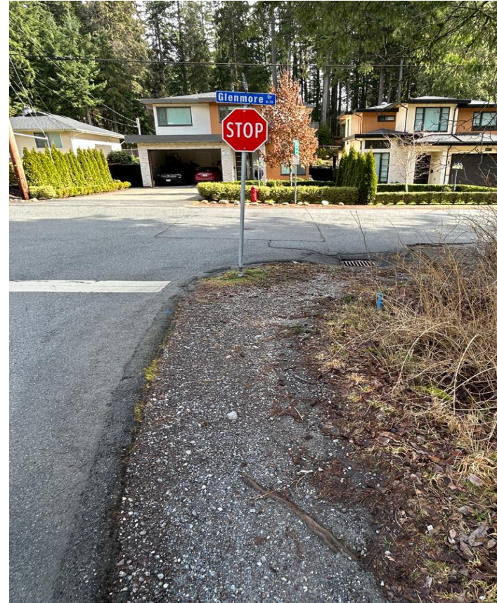
Morven Drive /Glenmore Drive intersection