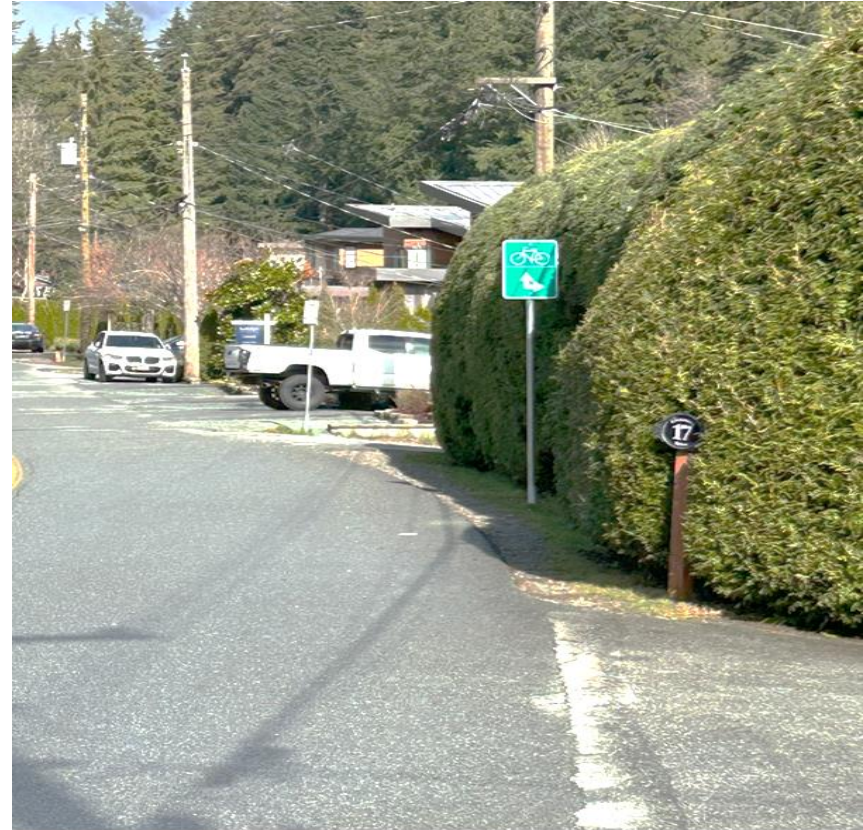
east side – mature hedge on the boulevard will be impacted