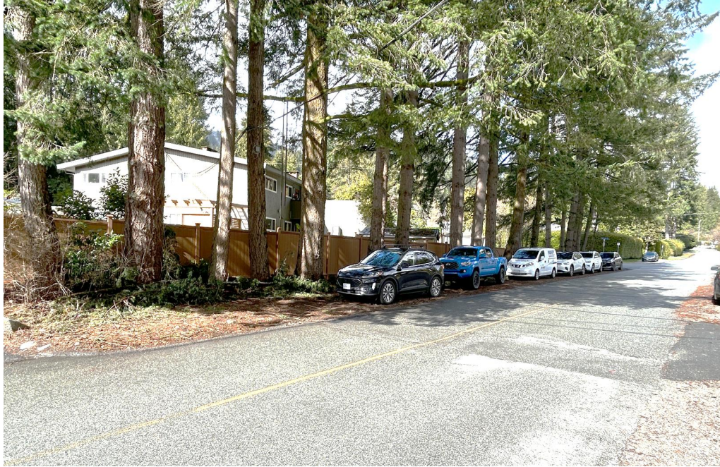
west side – parking at the north end of Glenmore Drive