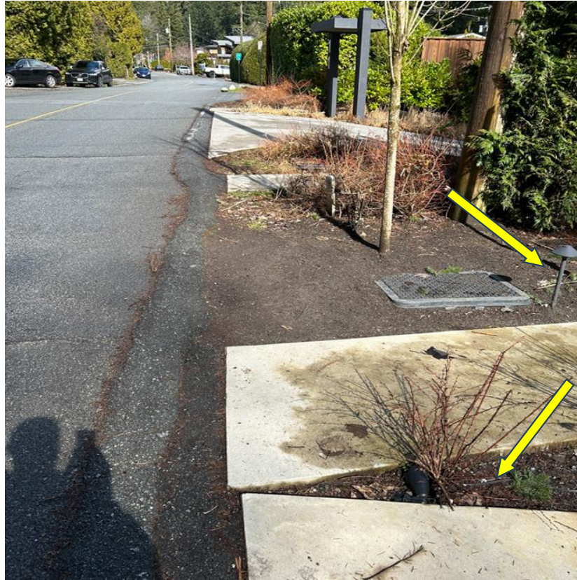
east side – temporary landscape lighting and irrigation on the boulevard may need to be moved