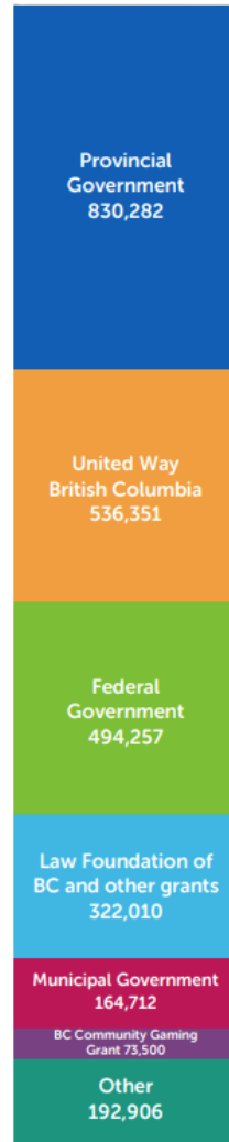
2023/2024 Revenues: $2,614,018