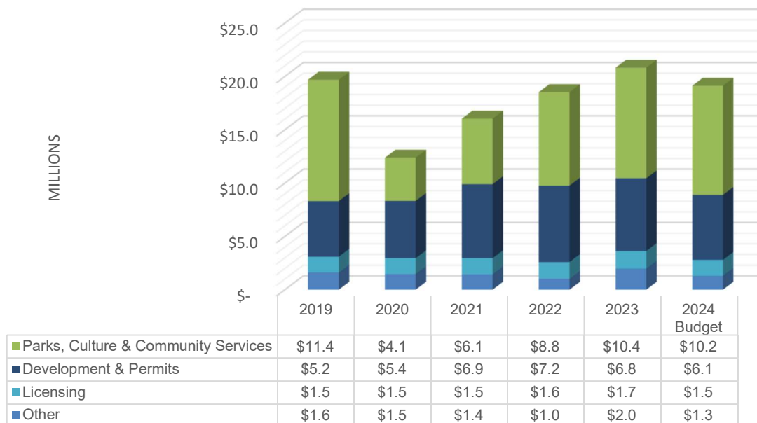
Fees and Charges Revenue by Service Area

In 2020, with the drastic cuts in community centre and cultural programs to abide by PHOs, PCCS fee revenue significantly dropped by $7.3 million. However, starting from 2021, the District continuously put efforts into reopening the community centres and programs, and revenue increased by $2.0 million in 2021, $2.7 million in 2022, and again by $1.6 million in 2023. For the 2024 budget, services and programs will return to pre-pandemic levels.