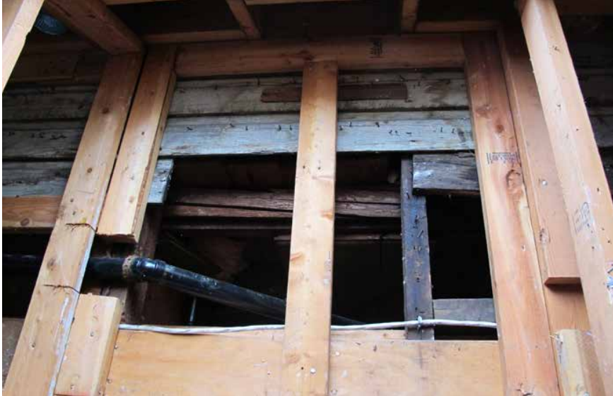
Siding behind later construction, Ground Floor East Side