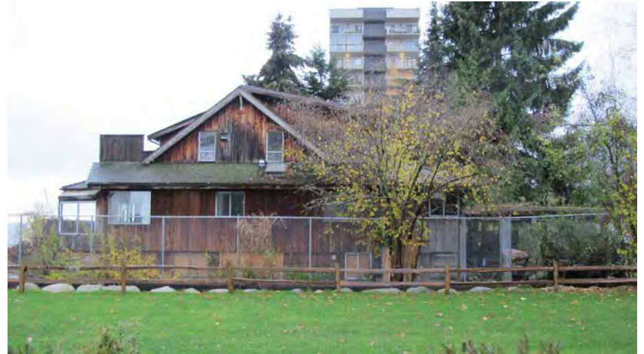
Existing East Elevation. November 2020