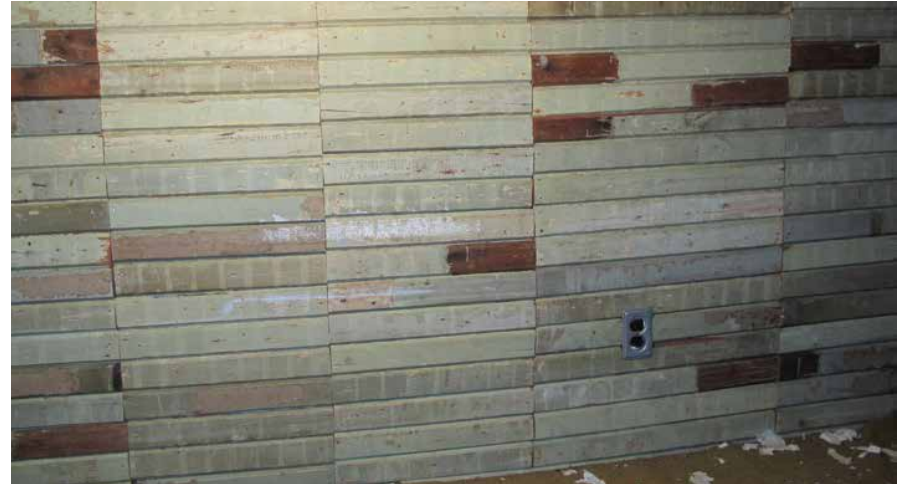
Basement Level wood sidings repurposed as cladding