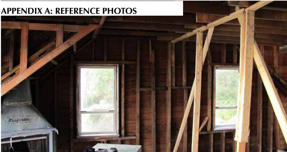
None of the window frames or assemblies have survived, but the window openings are clearly evident on the second floor and provide measurements for how the windows can be restored. Original double-hung configuration as per archival photos.