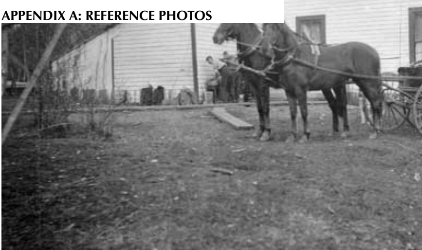
Second Floor Framing, West Side, 2021.