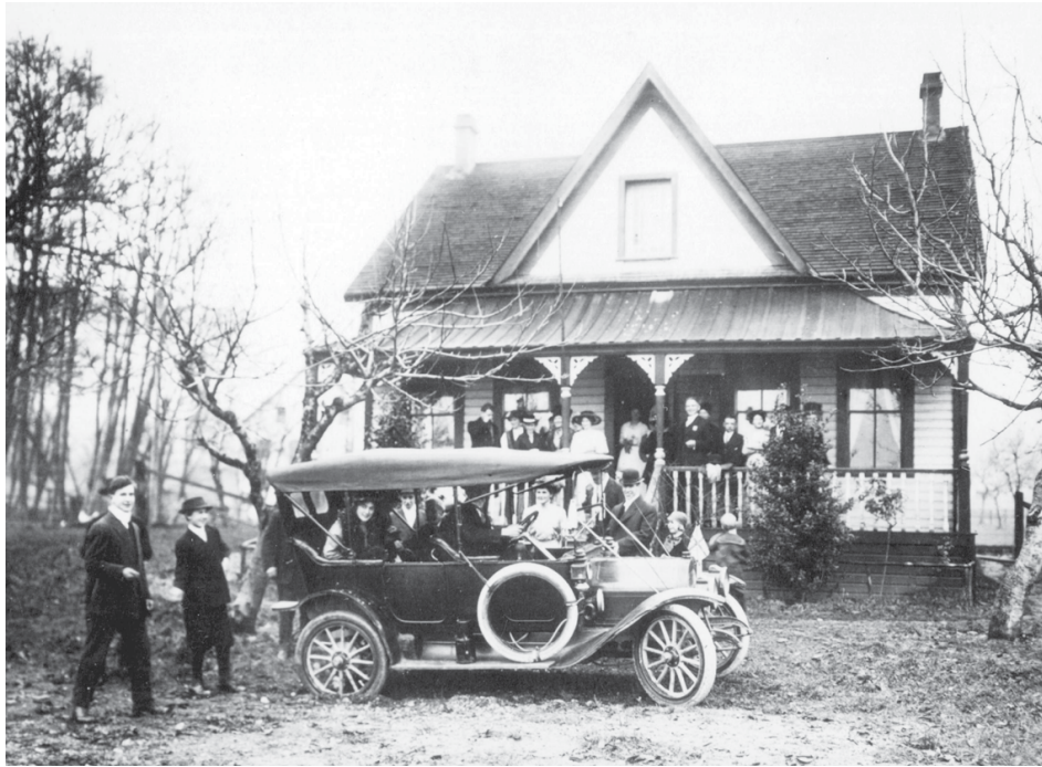
Simon Fraser Elementary School Annex, 1930