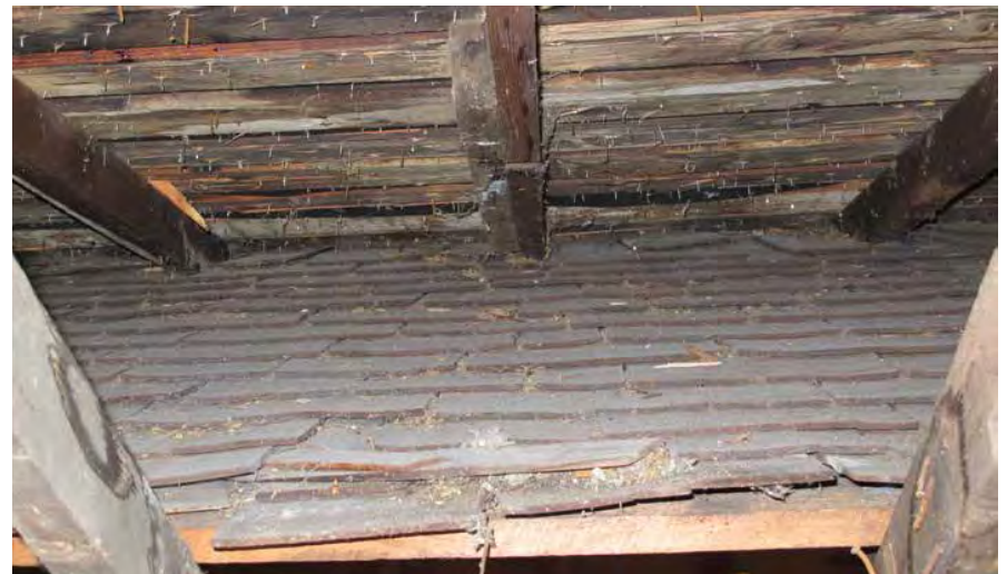
Evidence of chimney fire in the East Gables.