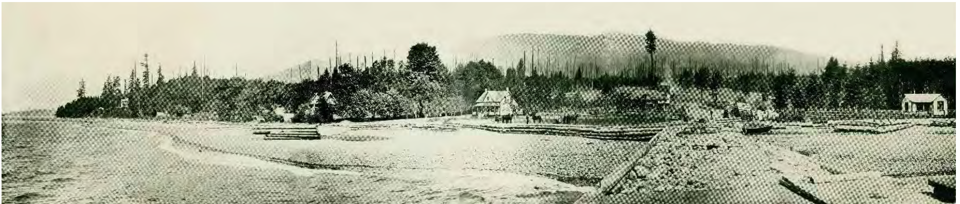
Hollyburn Waterfront Panorama, 1912(ca.)