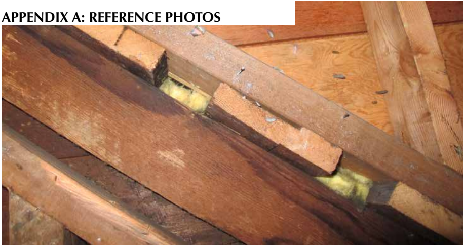
Cut-through roof structure showing original nailing strips.