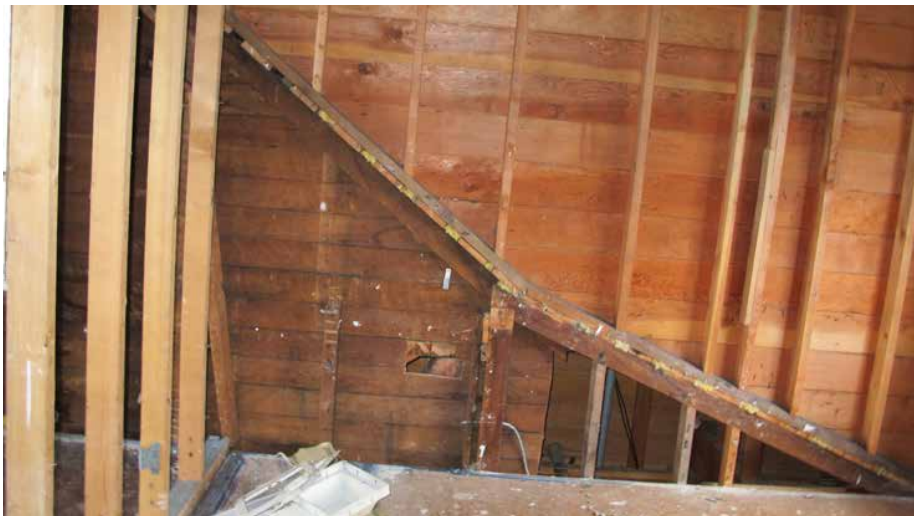
Siding behind later construction, Ground Floor East Side