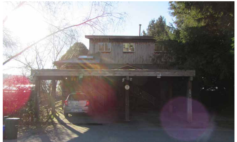
Existing North Elevation. January 2017