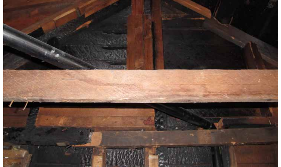
Evidence of chimney fire in the East Gables.