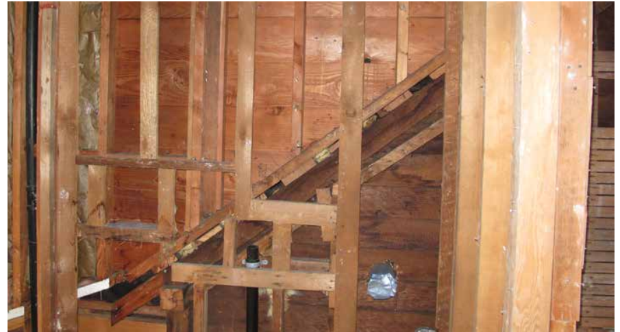
Although the roof framing has been cut out in several locations, virtually all of the planking that formed the exterior soffits were left in place, and can be traced on the east and west sides of the house.