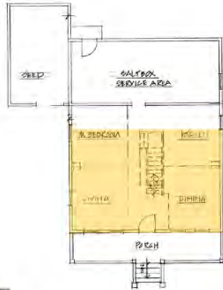
NAVY JACK HOUSE 1768 ARGYLE AVENUE

The following chapter describes the materials, physical condition and recommended conservation strategy for the Navy Jack House based on Parks Canada Standards & Guidelines for the Conservation of Historic Places in Canada .