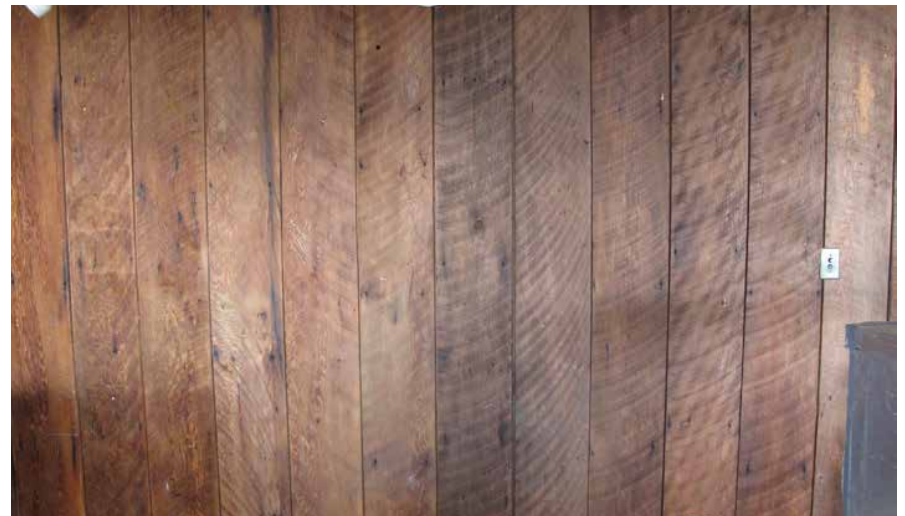
Living Room Sawn Lumber repurposed by homeowners