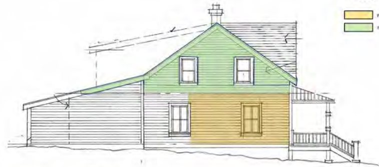
NAVY JACK HOUSE 1768 ARGYLE AVENUE

■ PARTIALLY INTACT FRAMING ■ INTACT FRAMING & SIDING