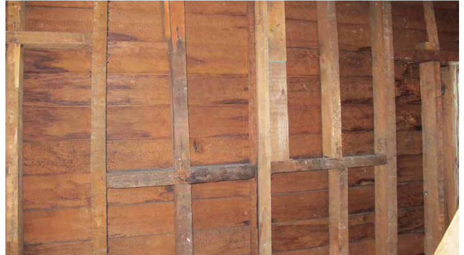
Backside of exterior cladding.