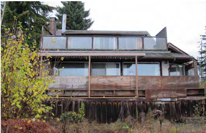
Existing South Elevation. November 2020