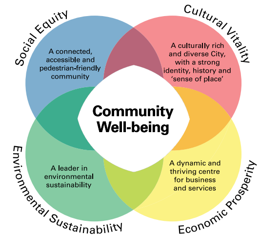
Four Pillars of Sustainability [CityPlan 2030 - City of Norwood]