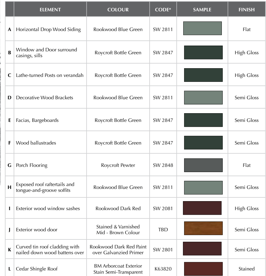
TABLE 511.1 - HISTORICAL COLOUR SCHEME: NAVY JACK HOUSE, 1768 ARGYLE AVENUE, WEST VANCOUVER BC