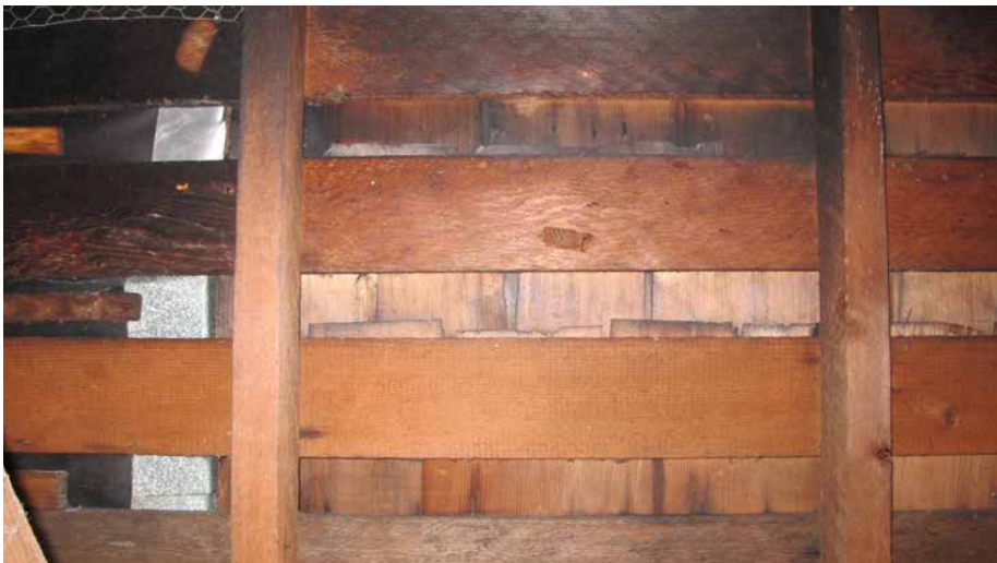
Underside of intact cedar shingle roofing