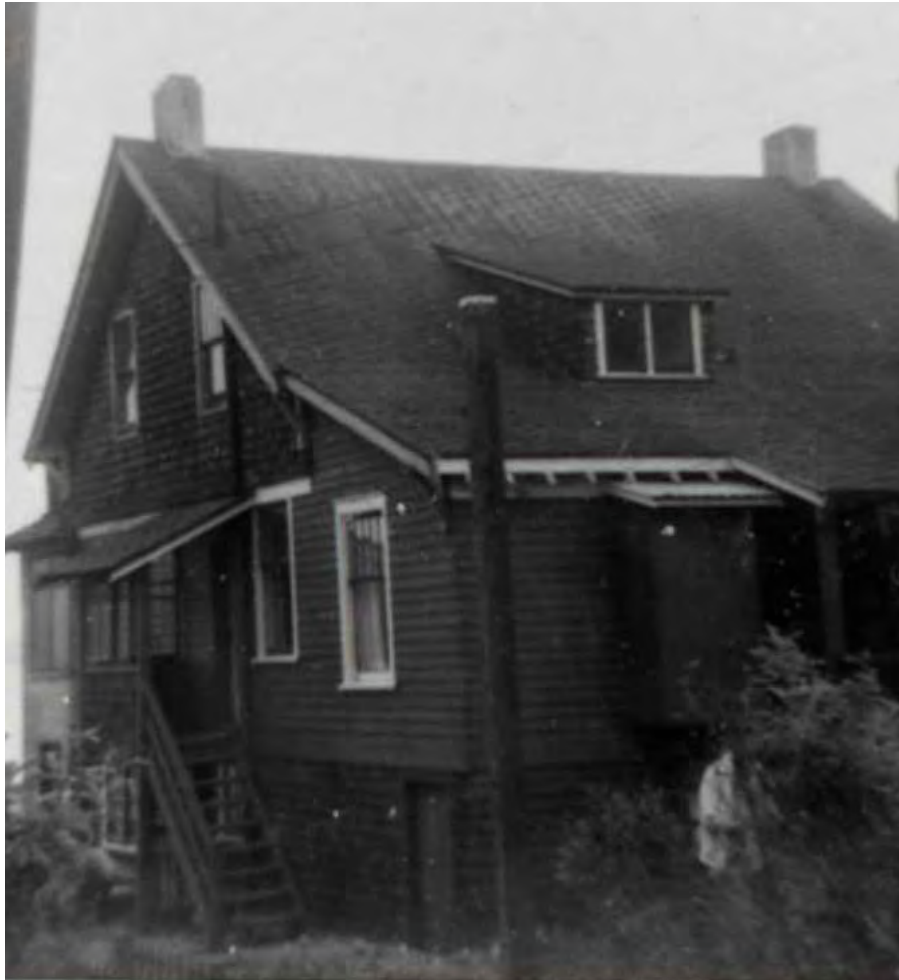
North Elevation facing Argyle Avenue.