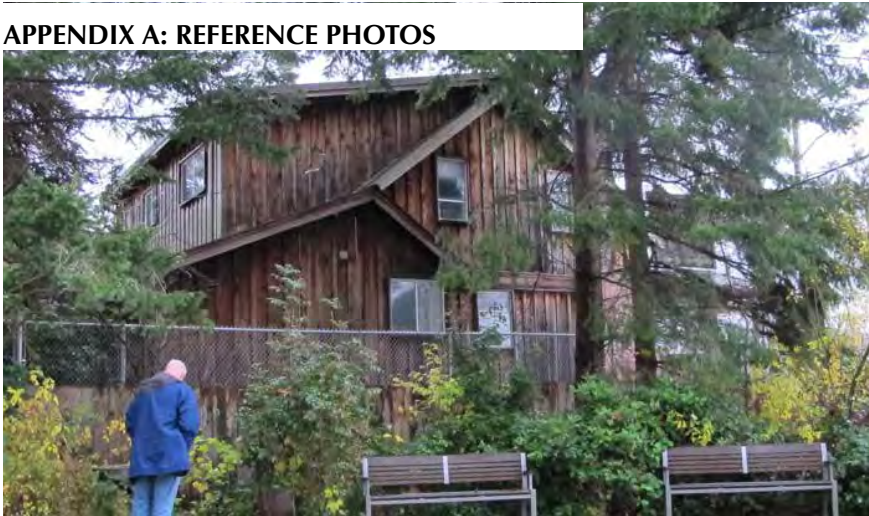
Existing West Elevation. November 2020