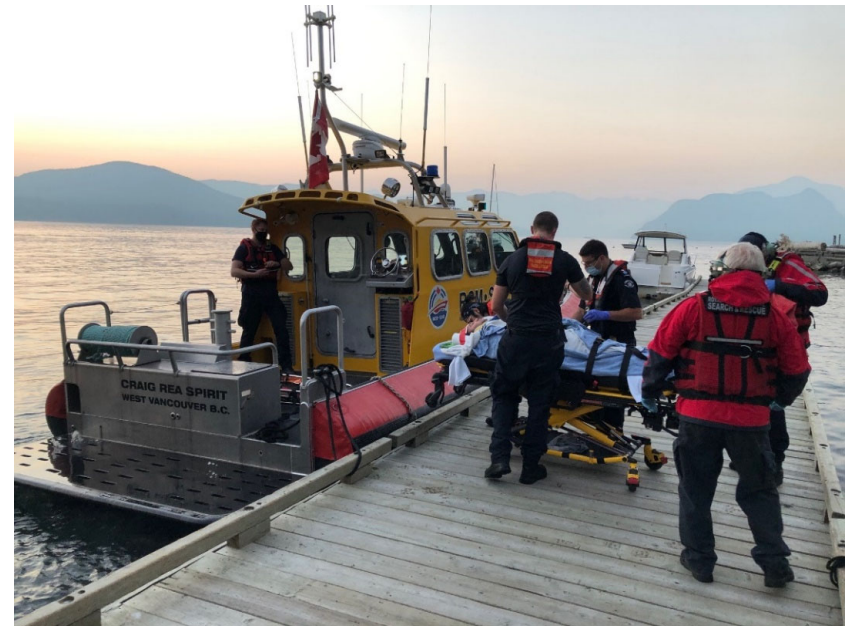
West Vancouver Marine Rescue Society