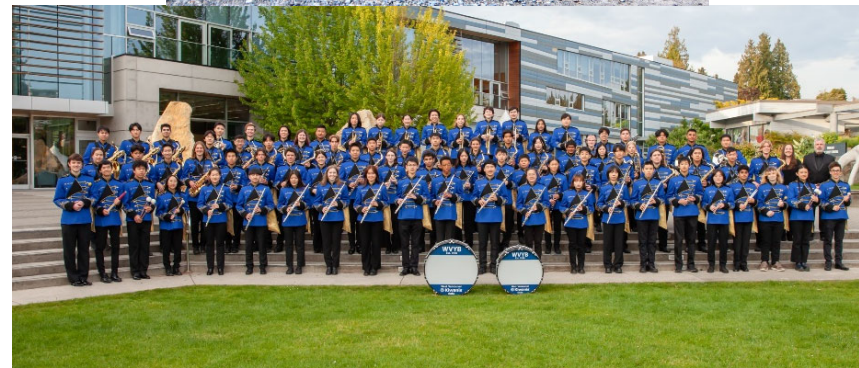
West Vancouver Youth Band Society