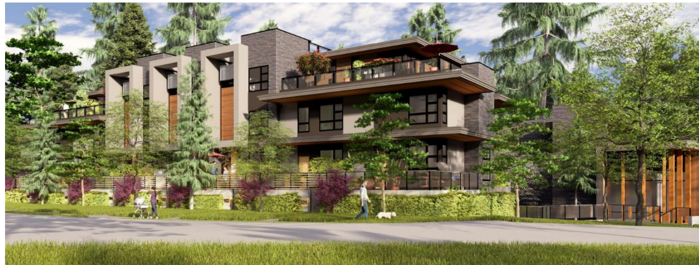
Building viewed from Woodcrest Road – amenity building seen on right side