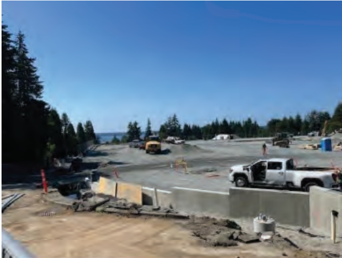
Installation of northeast retaining wall