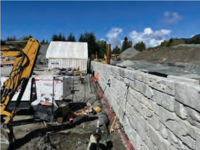
Construction of south retaining wall