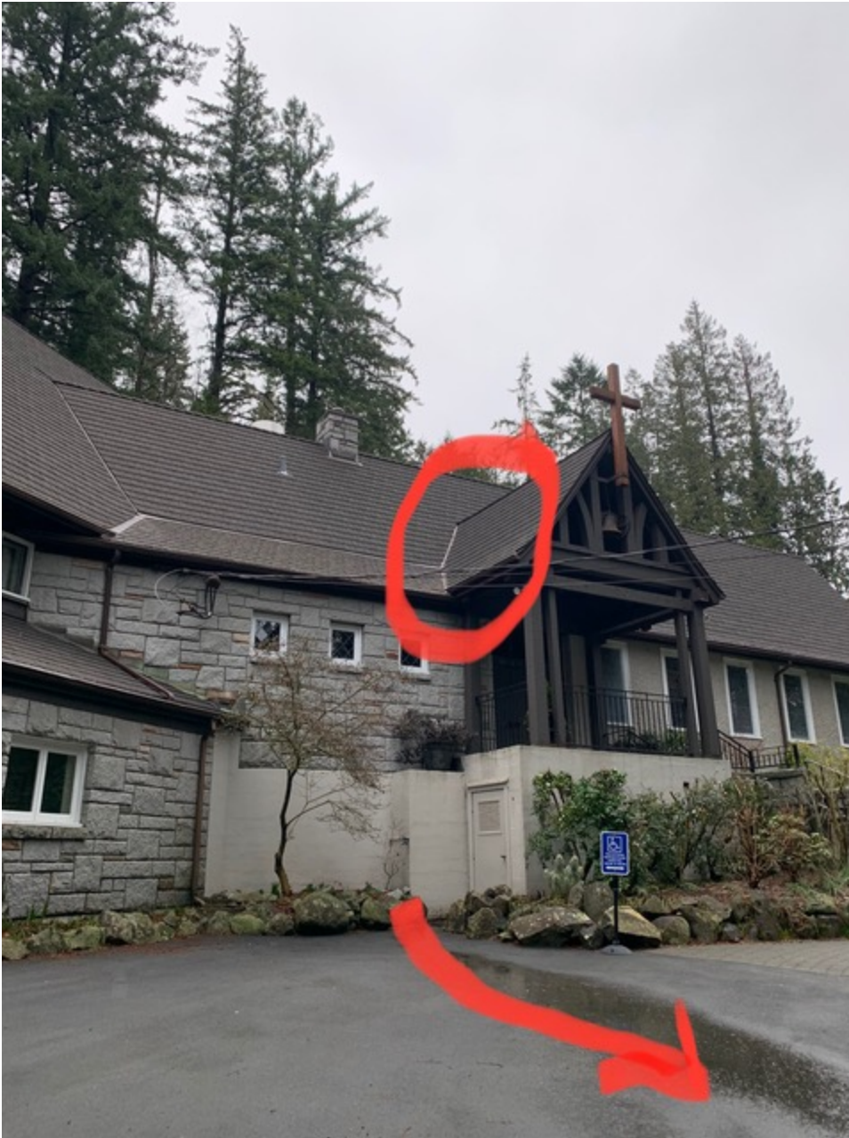
Please also note collected water at the base of the church, under the gutter area, that is problematic. Please also note splash back that illustrates that the majority of this water is from above and not from the driveway.