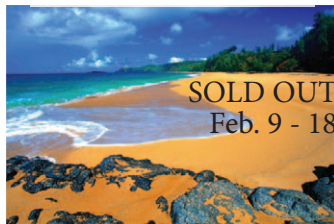
Maui & Kauai

Mar. 24 - Apr. 2 13 incl. meals dbl: $2,839