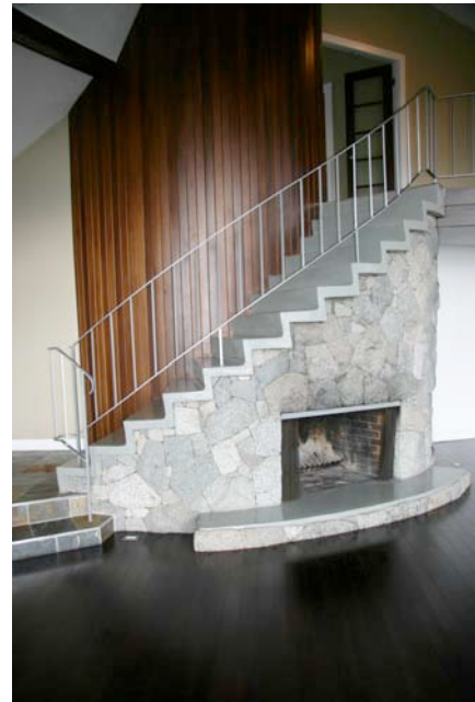
Granite fireplace with concrete stairs above