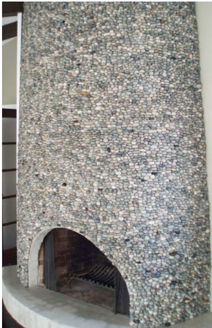
Fireplace of library