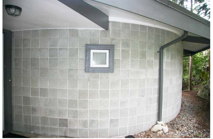
Curved 'Denstone' wall of the library