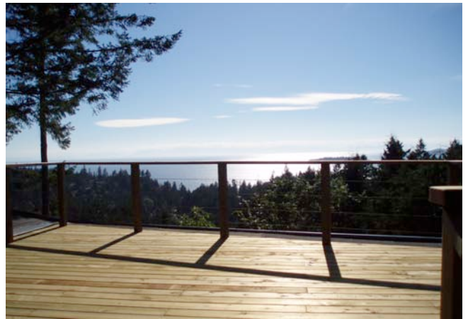
View from the back deck