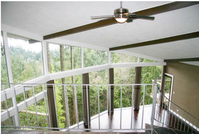
Exposed beams and large windows of the main room