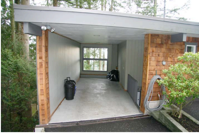
Carport, which is located above living space