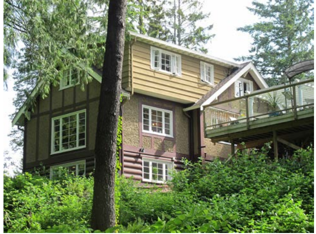
West and rear elevations