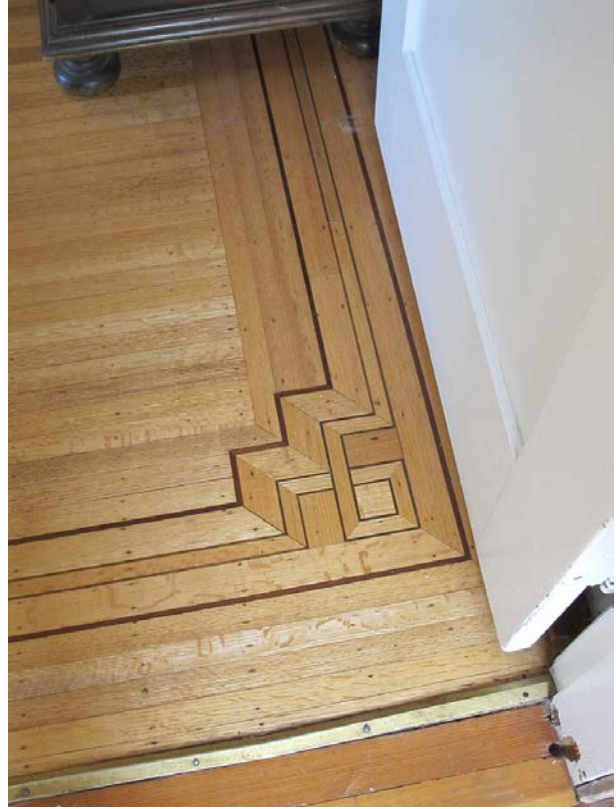
Hardwood floor with inlay