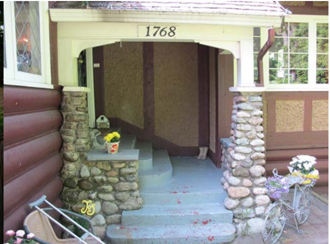
Covered front entryway