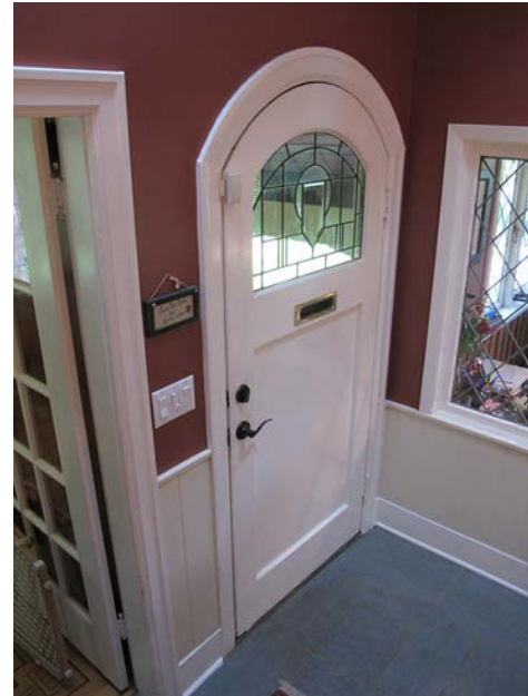
Front door from the inside