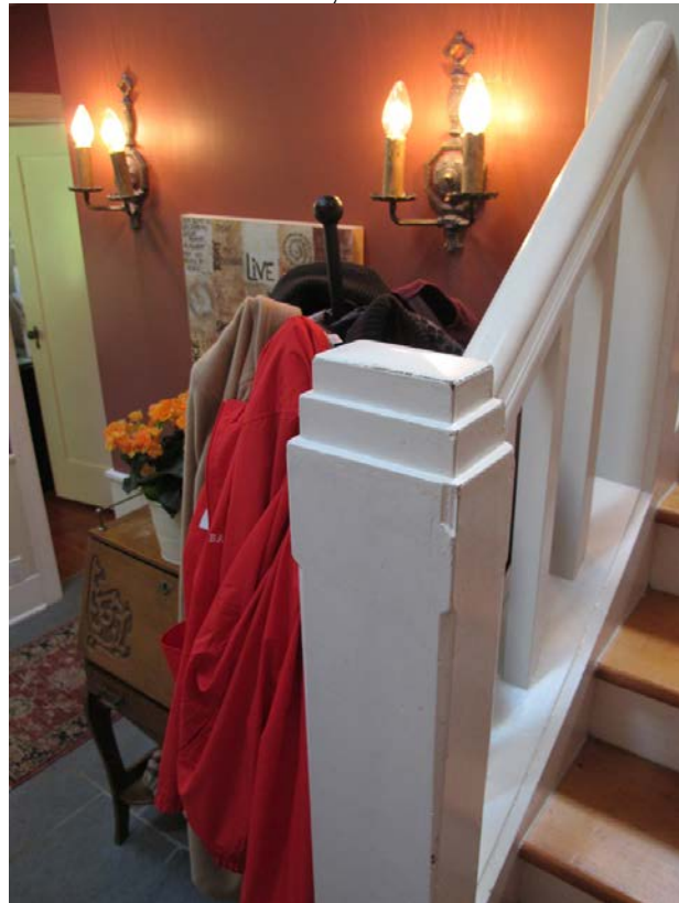
Staircase newel post