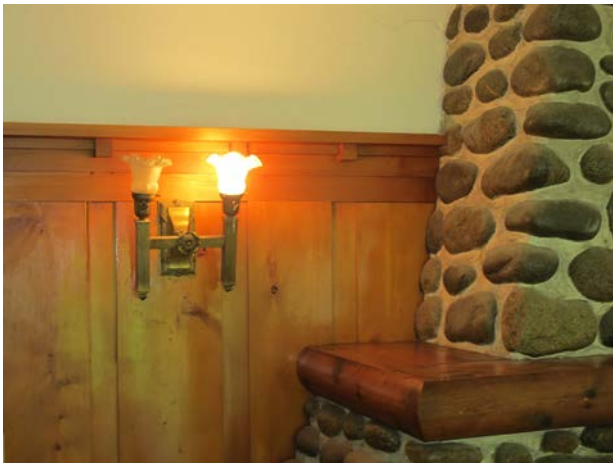
Light fixture, main floor