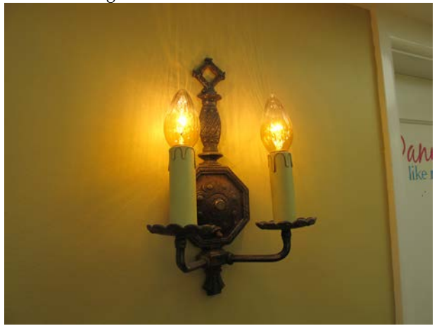
Light fixture, upstairs