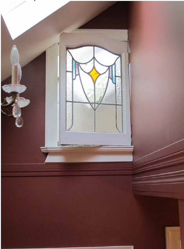
Stained glass window, now inside