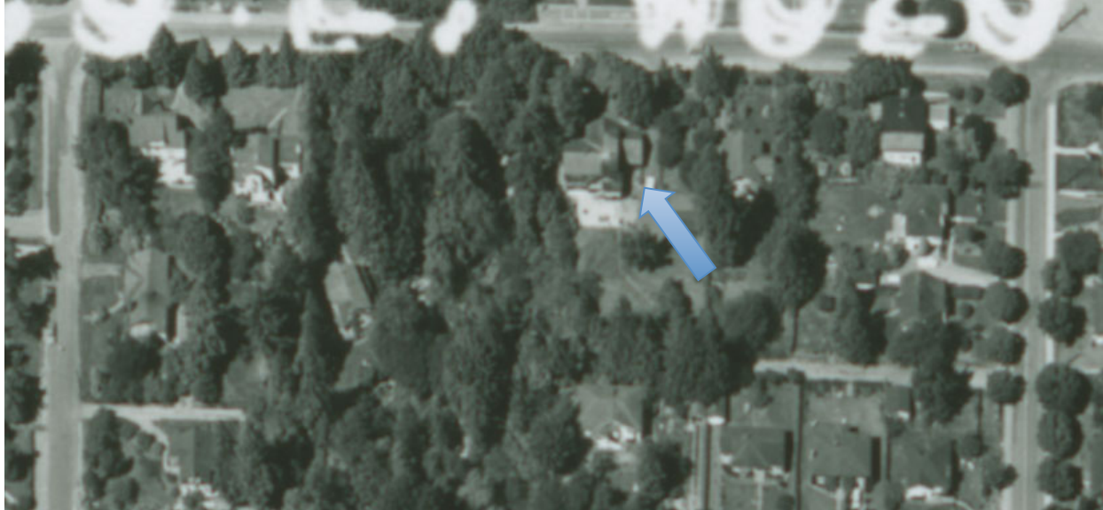
1962 Aerial showing the house and the Lawson Creek watershed directly to the left [Note the house has been expanded by this time]