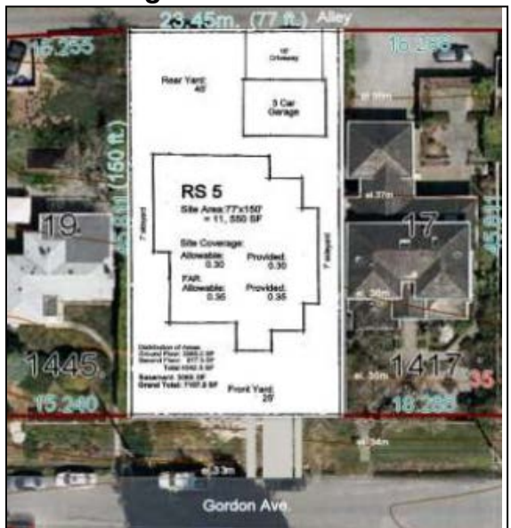
Figure 4: RS5 Development Potential

The minimum lot area within the RS5 zone is 6,000 square feet (558 square metres) and under the existing zoning, the site could be redeveloped with a new house of approximately 4,044 square feet (376 square metres), not including an in-ground basement or other exempted floor area (see Figure 4).