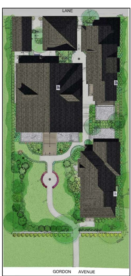
Figure 5: Proposed Site Plan

The original appearance of the Vinson House will be conserved and restored to the extent possible and the design of the infill units are done to complement the character of the main house by incorporating traditional details (see Figure 6). The proposed landscape plans include rebuilding the front stone wall and creating a pedestrian network through the site to the various buildings. An outdoor patio area/courtyard is created for each unit and an "Edwardian" garden concept is proposed to link the buildings to each other and the historical past of the Vinson House.