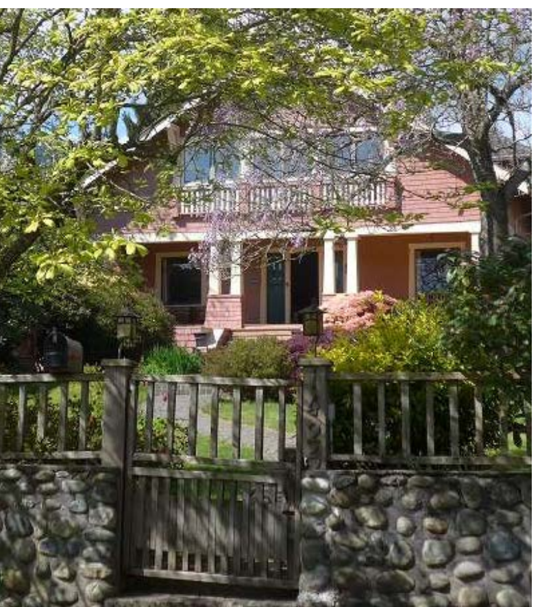
Figure 2: Vinson House, 2015

The Vinson House is located at 1425 Gordon Avenue in Ambleside, and is situated toward the rear of this gently sloping and oversized lot, being 11,555 square feet (1,073.5 square metres) in area. The lot is bounded by Gordon Avenue to the south, a rear lane to the north, and two single-family residential lots to the east and west being approximately 9,000 square feet (838 square metres) and 7,450 square feet (692 square metres) in area each respectively.