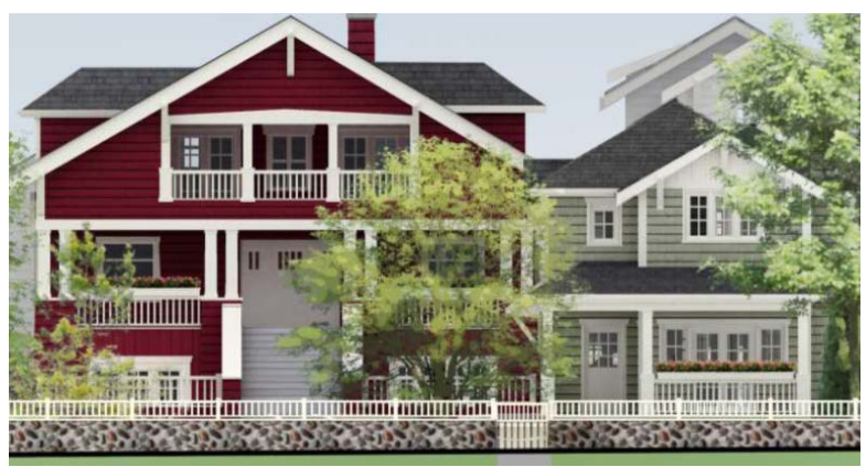
Figure 6: Proposed South Elevation

The development proposal is attached as Appendix F <sup>1</sup>.