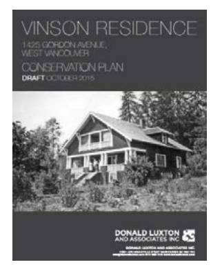
Figure 7: Vinson House Conservation Plan

A Conservation Plan, including a Statement of Significance (SOS) for the Vinson Residence was prepared by Don Luxton and Associates (October 2015) (see Figure 7) and is included for your review and reference as Appendix B . The SOS describes the heritage resource, includes a statement of heritage value, and outlines the "character defining" elements of the house and the site.